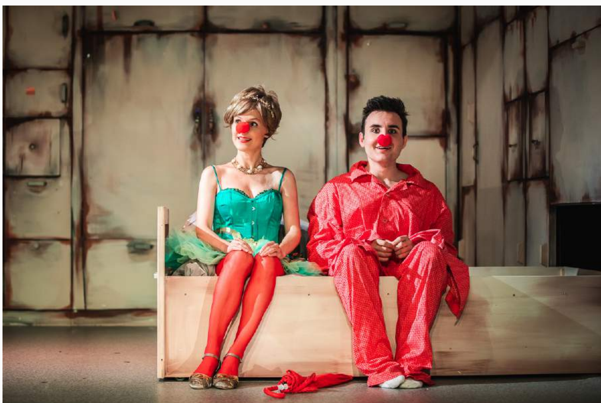
Alone and Esmeralda